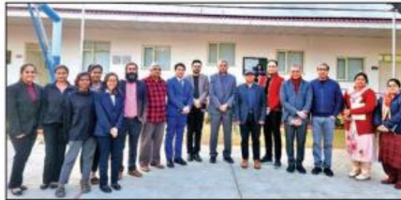
IIM Jammu and IIT Delhi faculty and students after a session.